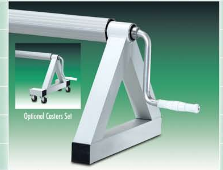
Optional Casters Set